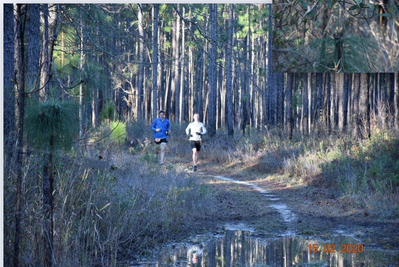
Runners return from first of 5 laps of 50K Ultra