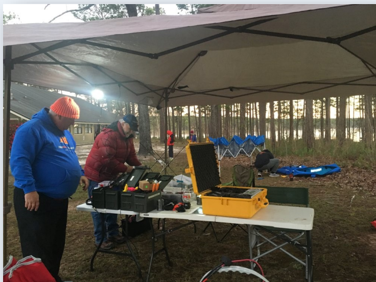
The station for the 50K Ultra.