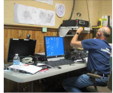
at ARES COOP site at ESAR.