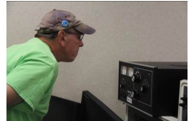
In ARES room at EOC – connecting the 1500 watt amt.